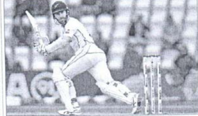
New Zealand captain Kane Williamson scored a 177 ball 49 in Southampton on Tuesday.

According to the Cricviz Analytics, it was the slower Willamson had batted up to 100 balls, just 15 runs from the 100 balls. Kane Williamson has scored fewer runs from the first 100 balls of a Test innings. Cricviz tweeted it added, "Kane Williamson's run rate in this match (0.26 rpi) was the slowest for any batsman in Test cricket in the last decade in Test cricket (min 400 runs).